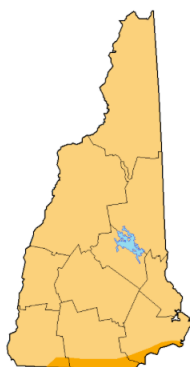
< July 19, 2022 >